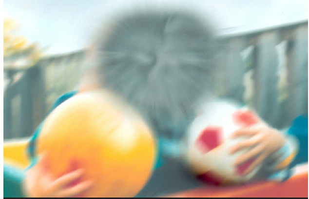
Age-related Macular Degeneration